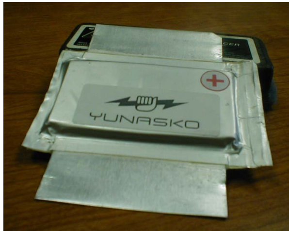
Fig.3. Photograph of the 5000F Yunasko hybrid Supercapacitor device