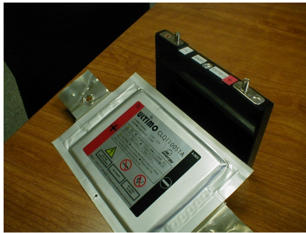
Fig.2. Photographs of the JSR Micro 1100F and 2300F devices