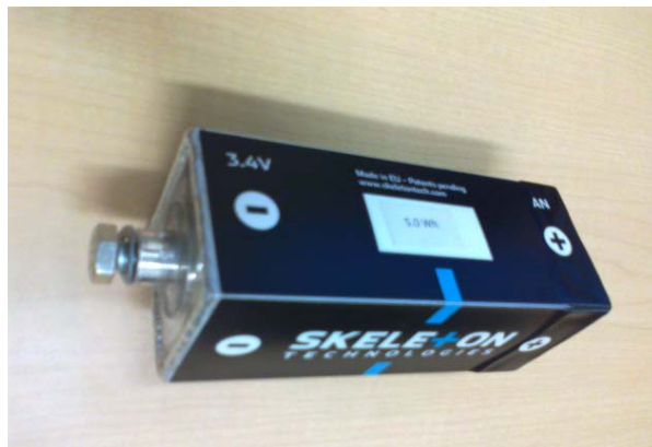
Fig.1. Photograph of the 3200F Skeleton Technologies device

The Yunasko 5000F hybrid device (Figure 3) utilizes carbon and a metal oxide in both electrodes. Different metal oxides are used in the two electrodes and the percentages of the metal oxides are relatively small. Test results for the device are given in Table 3. The voltage range of the device is 2.7 - 1.35V. The energy density is 30 Wh/kg for constant power discharges up to 4 kW/kg. The device has a low resistance and consequently, a high power capability of 3.1 kW/kg, 6.1 kW/L for 95% efficient pulses.